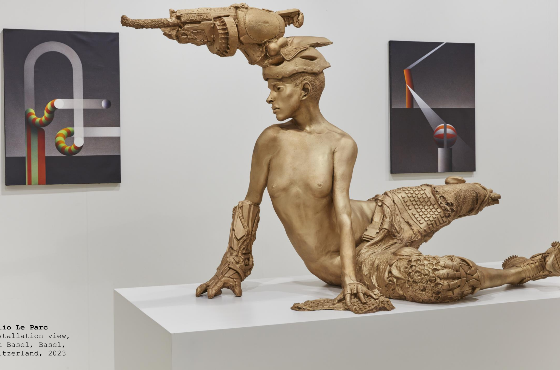
Julio Le Parc Installation view, Art Basel, Basel, Switzerland, 2023