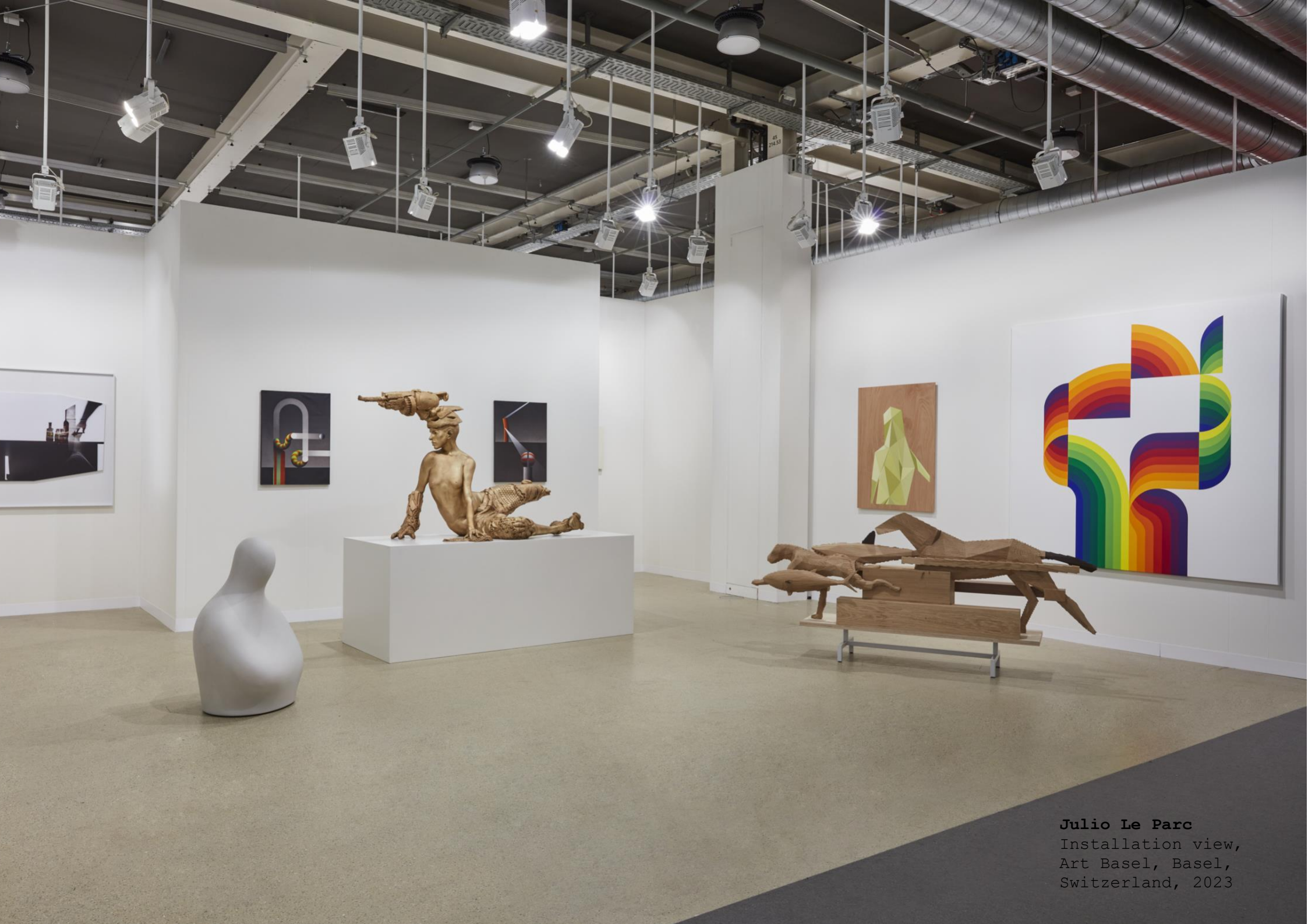
Julio Le Parc Installation view, Art Basel, Basel, Switzerland, 2023