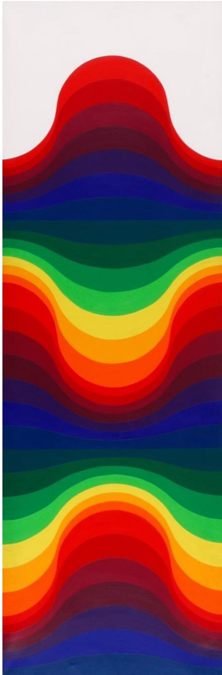
Julio Le Parc Ondes 106B no.12 , 1972 Acrylic on canvas 150 x 50 cm (59 1/8 x 19 3/4 in.)