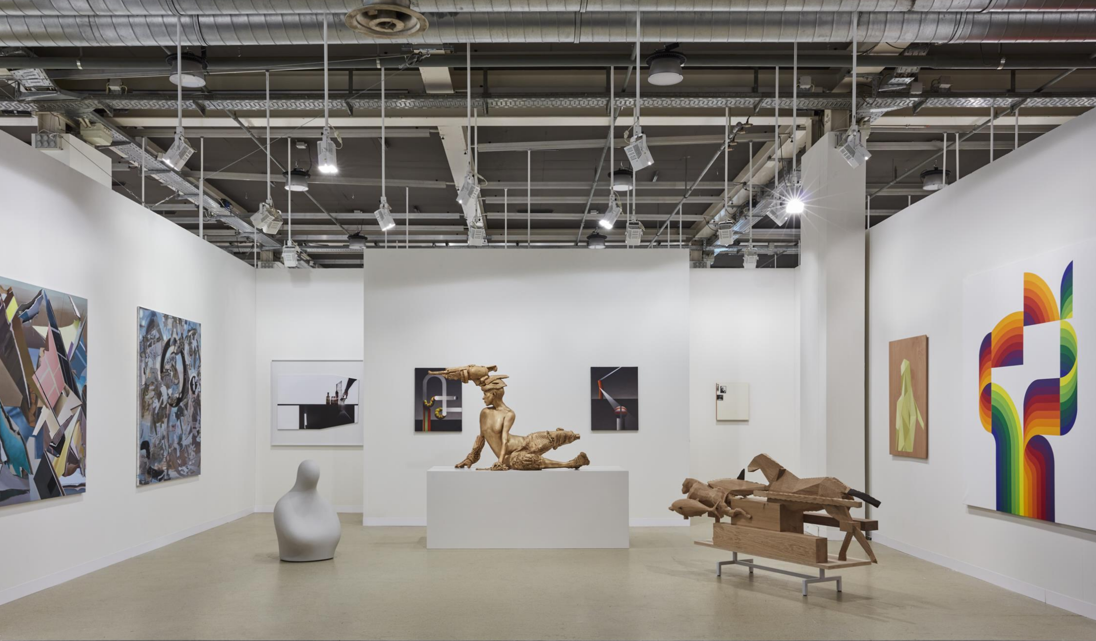
Julio Le Parc Installation view, Art Basel, Basel, Switzerland, 2023