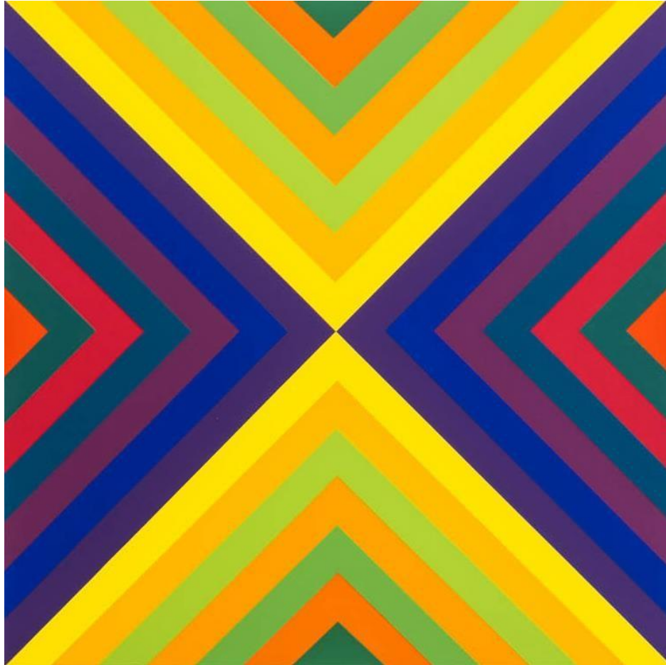
Julio Le Parc Série 15 No.1 et 8, 2022 Acrylic on canvas 80 x 80 cm (31 1/2 x 31 1/2 in.)