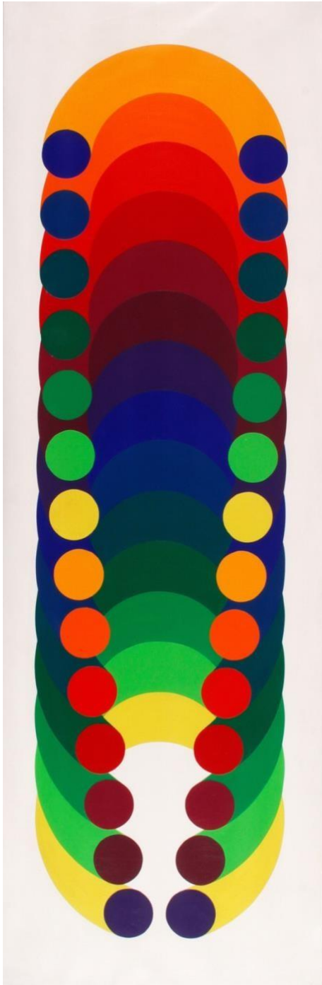
Julio Le Parc Volume Virtuel 21 , 1974 Acrylic on canvas 150 x 50 cm (59 1/8 x 19 3/4 in.)