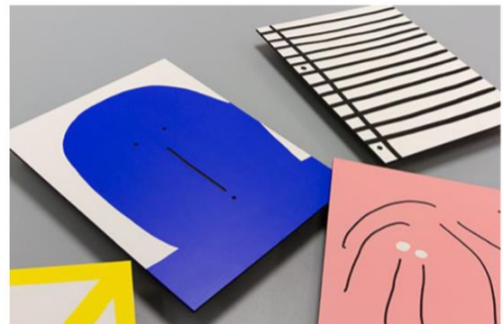
Cornelia Baltes: Turner