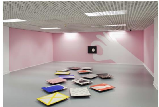
Cornelia Baltes: Turner

For instance in Turner , an exhibition of her work at the Northern Gallery for Contemporary Art in Sunderland last year, each of Cornelia's paintings were installed on wheels on the floor of the exhibition space, in order to be moved, arranged and curated by the audience. For such luscious pieces of work this interaction is a treat; the artworks are so appetising you want to hold them. Rather than being guarded on a gallery wall Cornelia invites you to enjoy them up close.