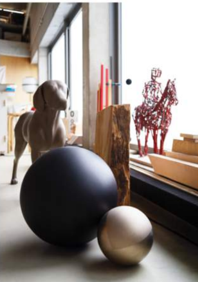
Prototypes for various projects are displayed throughout his studio. The dog is from a series of canine sculptures he created in 2019, and the horse and rider work is from 2002.