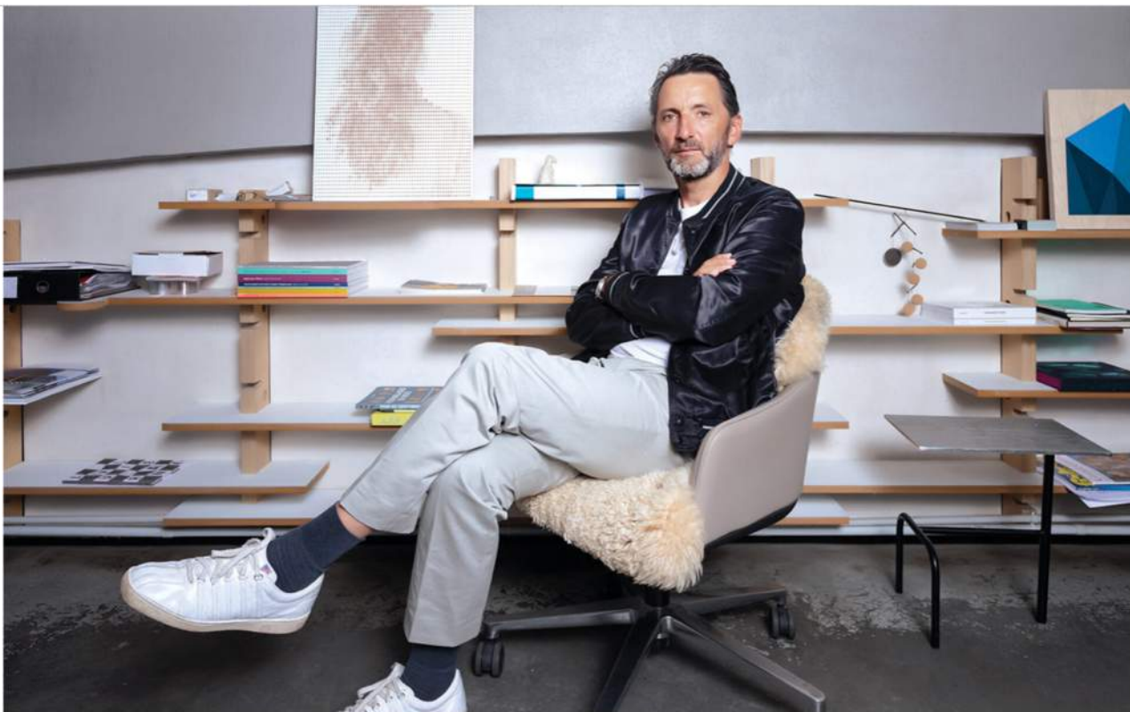
Xavier Veilhan in his Paris studio