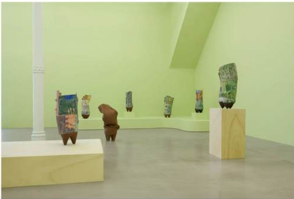
Exhibition view: Ranti Bam, Anima , James Cohan, New York (17 May–26 July 2024).

All this boils down to what Bam summarises as 'softness'—a condition that defines her abstract vessels. Each sculpture is composed of thinly rolled clay slabs that are painted on or mono-printed with pigmented slips before their assembly into delicate, oblong vessels that rest on legs or curved bottoms.