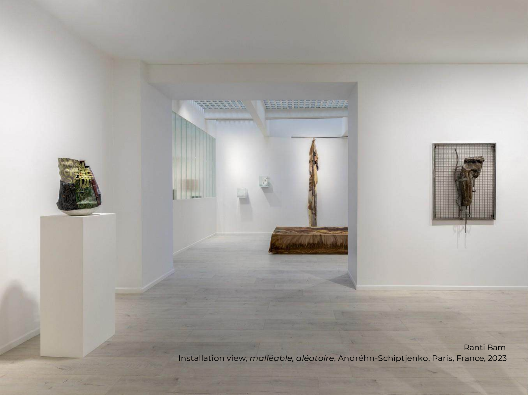
Ranti Bam Installation view, malléable, aléatoire , Andréhn-Schiptjenko, Paris, France, 2023