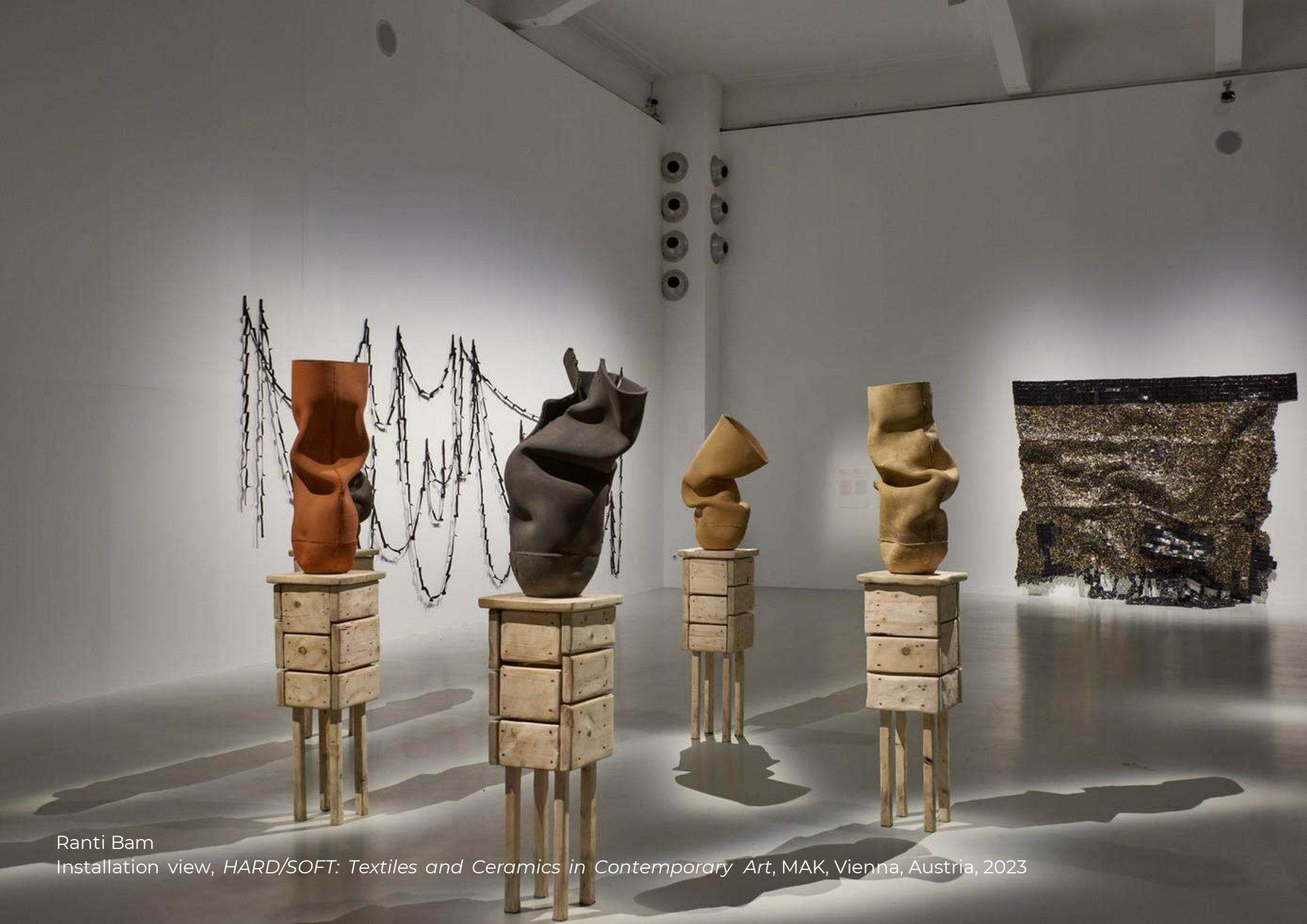
Ranti Bam Installation view, HARD/SOFT: Textiles and Ceramics in Contemporary Art , MAK, Vienna, Austria, 2023