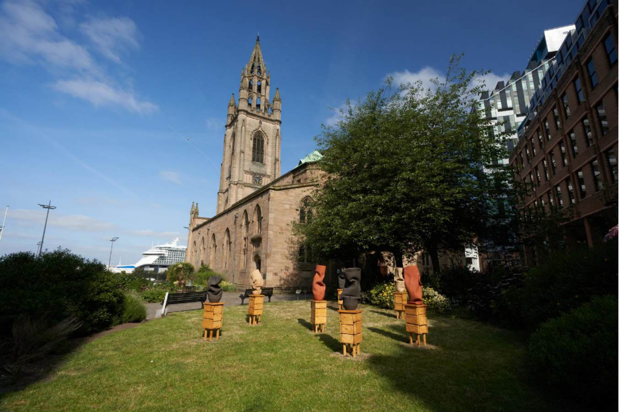
Ranti Bam Installation view, uMoya , Liverpool Biennale, Liverpool, United Kingdom, 2023