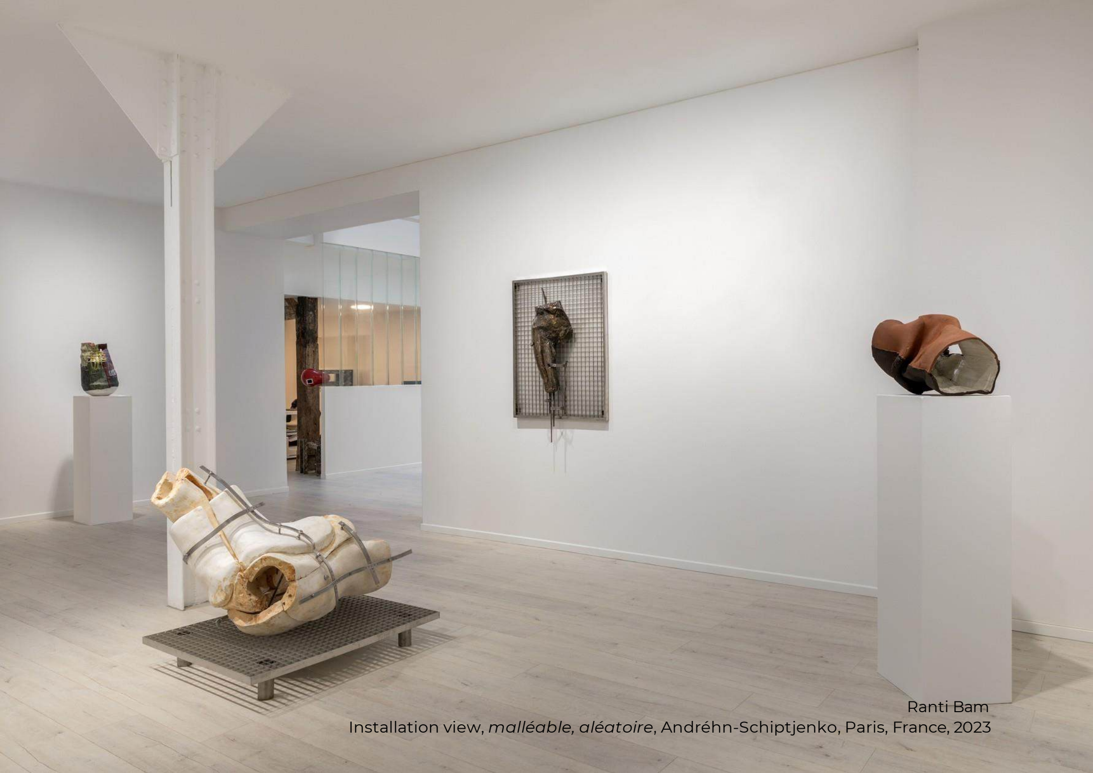
Ranti Bam Installation view, malléable, aléatoire , Andréhn-Schiptjenko, Paris, France, 2023