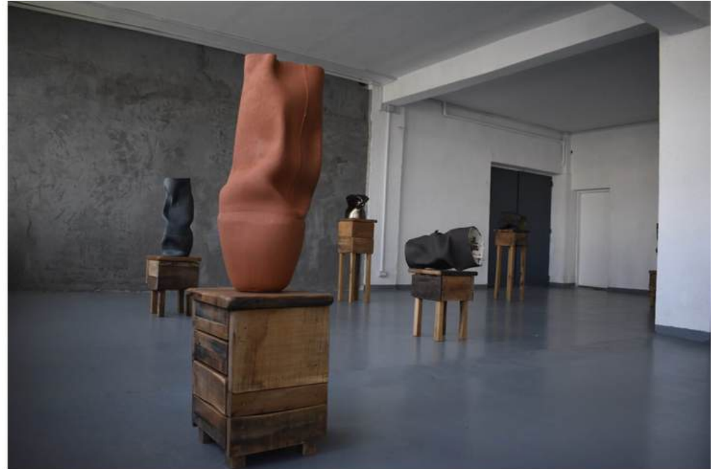
Installation view of "Ranti Bam: Common Ground" at Catinca Tabacaru Gallery in Bucharest.

With clay as her medium of choice, Bam's artistic approach is fundamentally sensually based, considering the energetic value held in all humans, objects, and ultimately the earth itself. Environmental considerations manifest in her work, as she considers clay as an immediate connecting point with her natural surroundings. Bam views her practice through a curative lens that embodies a planetary conscience, facilitating the necessary and urgent healing between humans and their natural habitat, adopting animist belief systems.