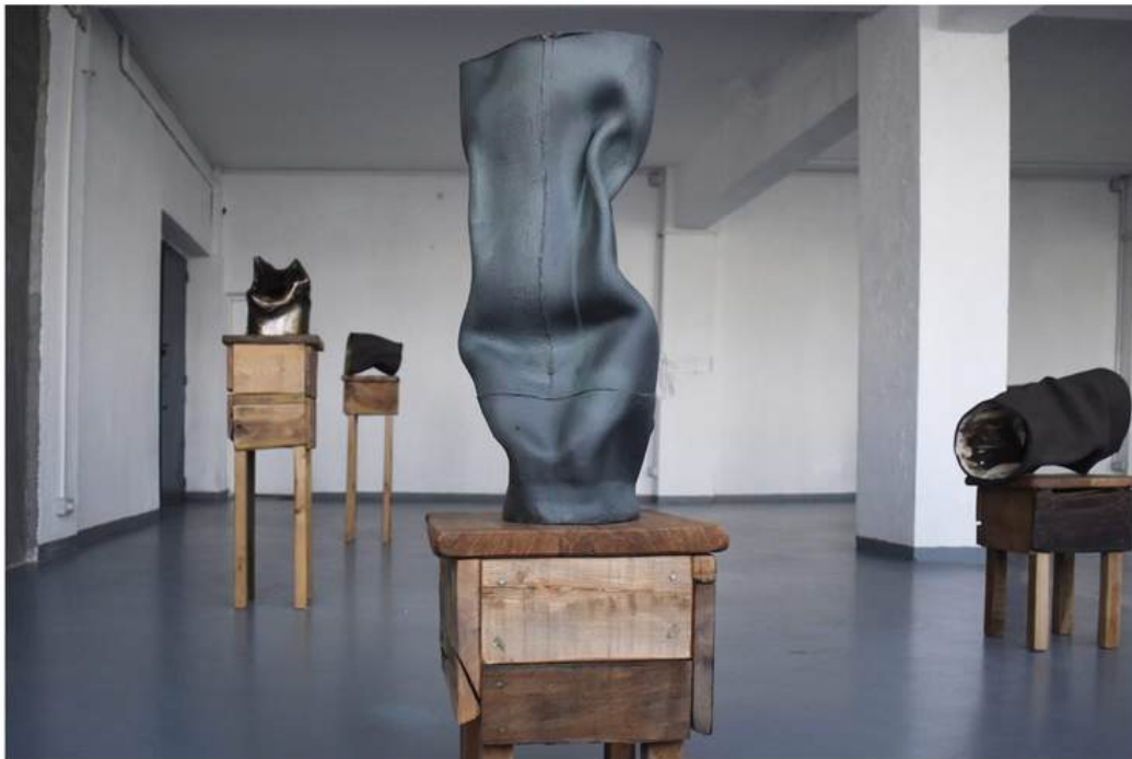
Installation view of "Ranti Bam: Common Ground" at Catinca Tabacaru Gallery in Bucharest.

A second room features a two-channel video installation of the Osogbo Sacred Grove where Bam has spent time for the conception of this series. This offers a welcome balance to the exhibition, helping to root the work.