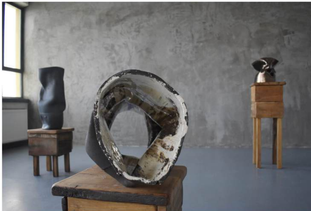
Installation view of "Ranti Bam: Common Ground" at Catinca Tabacaru Gallery in Bucharest.

What emerges through this outlook is a dialogue between the known and the experienced, combining body and intellectual knowledge, synthesised with the power of spirit – re-imagining empiricism through the lens of African spirituality.