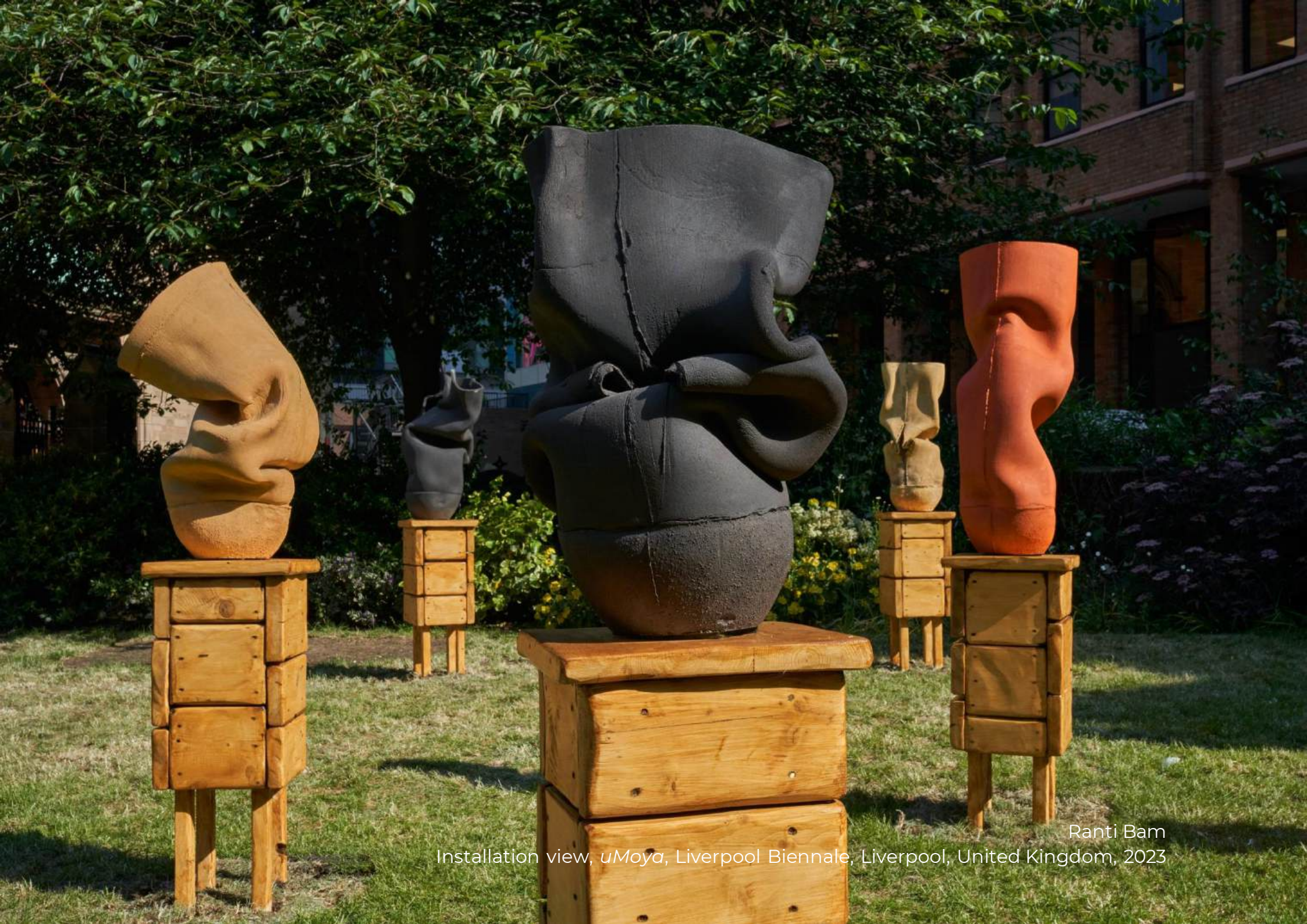
Ranti Bam Installation view, uMoya , Liverpool Biennale, Liverpool, United Kingdom, 2023