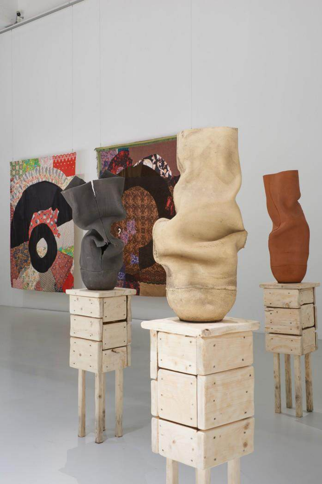
Ranti Bam Installation view, HARD/SOFT: Textiles and Ceramics in Contemporary Art , MAK, Vienna, Austria, 2023