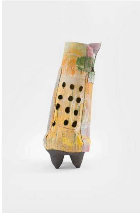
Ranti Bam, Mimo (2024). Glazed stoneware, 73.7 x 30.5 x 30.5 cm. © Ranti Bam 2024. Courtesy the artist and James Cohan, New York. Photo: Matthew Herrmann.

The exterior of each vase is left unglazed, accentuating the delicate cracked surfaces that speak to the artist's collaboration with her material, where she tests clay's capabilities by rolling sheets as thinly as possible and firing vessels as one piece and at high heat. By contrast, the inside of each form is glazed, as if to reflect on the idea of the anima as a luminous, reflective interiority.