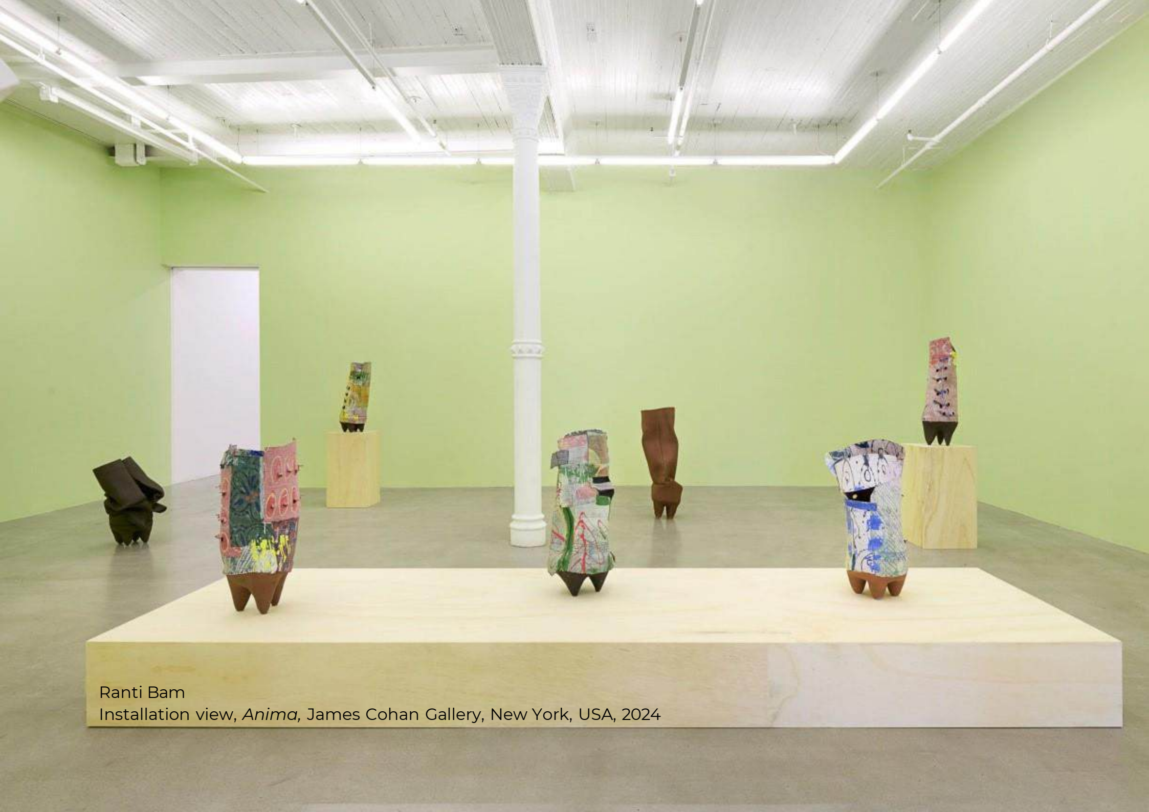
Ranti Bam Installation view, Anima , James Cohan Gallery, New York, USA, 2024