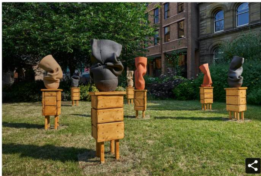
Ranti Bam, Ifas , 2023.