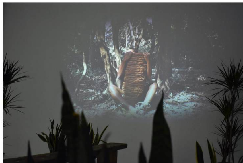
Installation view of "Ranti Bam: Common Ground" at Catinca Tabacaru Gallery in Bucharest.

The artist's universe reflects the richness and multitude of these influences. Upon arriving on the third floor of an abandoned warehouse adjacent to a major highway junction, there is something quite special, if not mesmerising, about seeing a vast open space, solely filled with Bam's hearths. The works on display are part of a series titled Ifa , at once referring to Ifáá, meaning "to pull close" in Yoruba, and Ifá, the Yoruba system of divination.