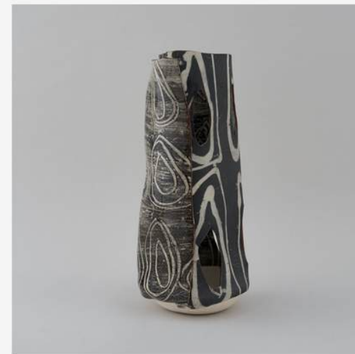
Lisi, 2019 Terracotta 38 x 16cm by Ranti Bam

“ It's about saying to the clay “show me what you can do! Where can we go together?” ”